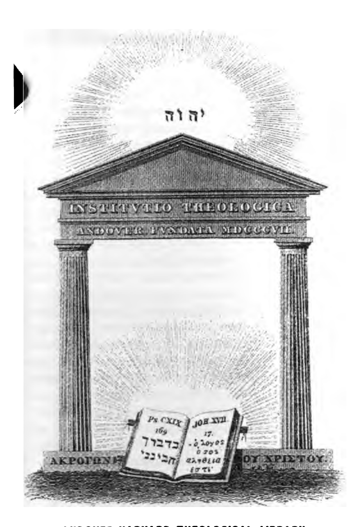
ANDOYER-HARVARD THEOLOGICAL LIBRARY M D C C C C X CAMBRIDGE, MASSACHUSETTS